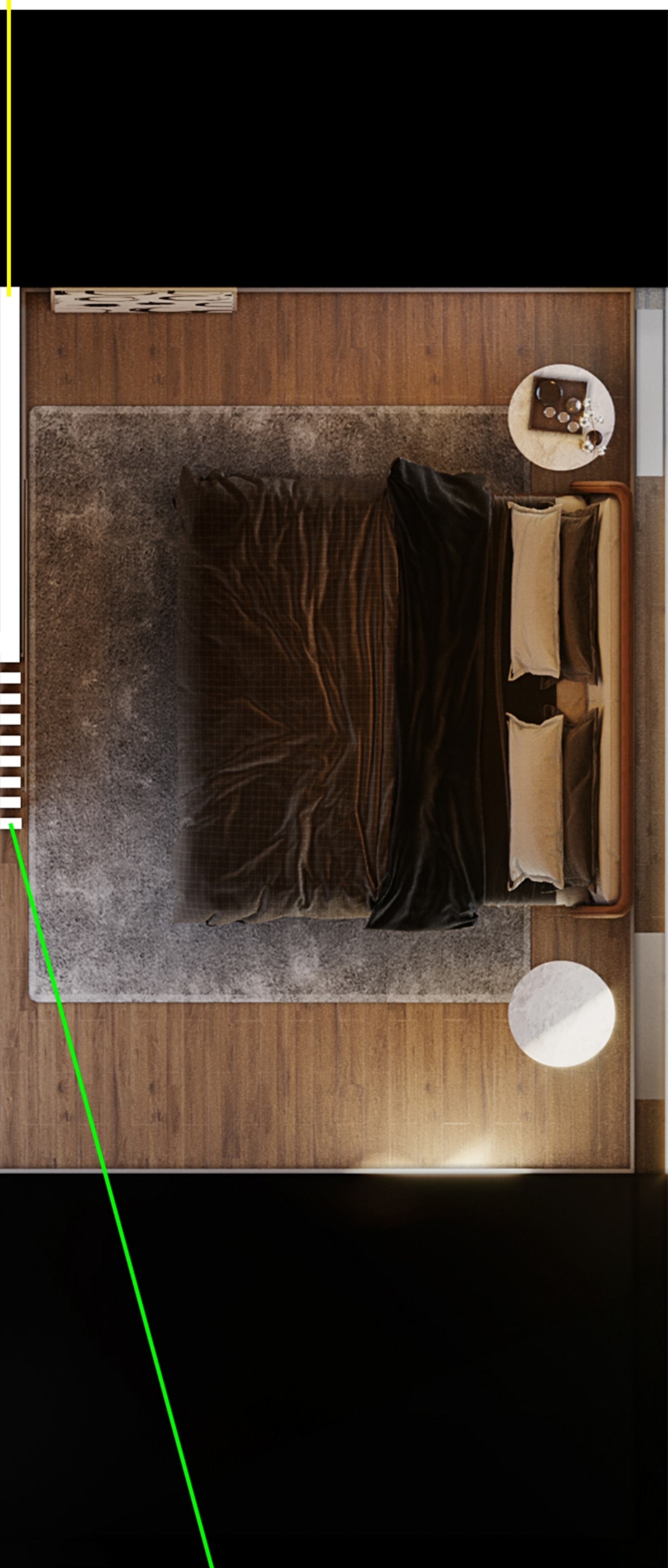
Increasing functionality without completely separating the translucent and space by adding 2 "x 4" wooden studs that rise up to the ceiling.