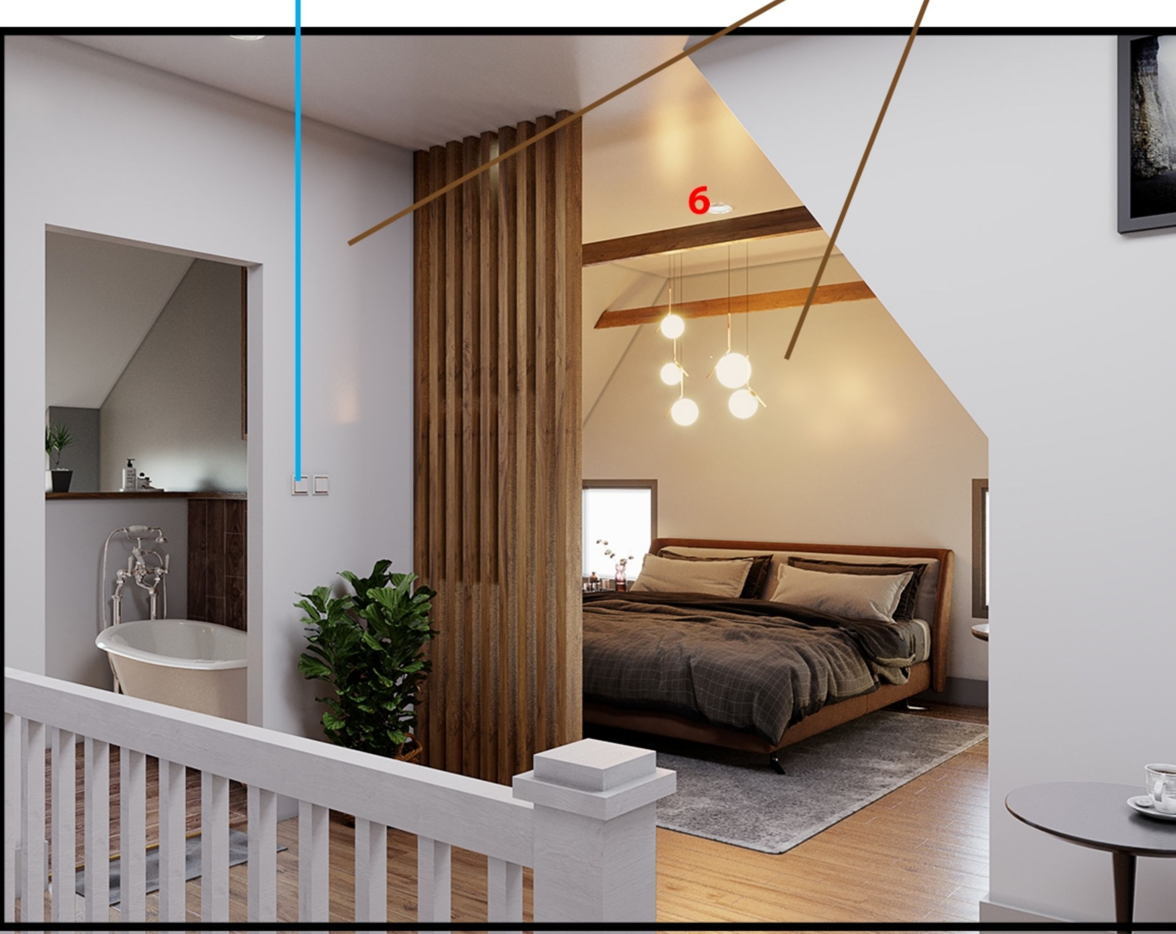
Using different types of lighting to strengthen the separation within the space